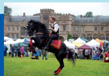
FORDE ABBEY Annual Charity Summer Fair 26 July 2018